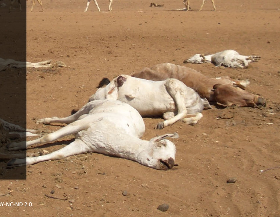
Photo credit: Brendan Cox, Oxfam International, 2004. Creative Commons CC BY-NC-ND 2.0.