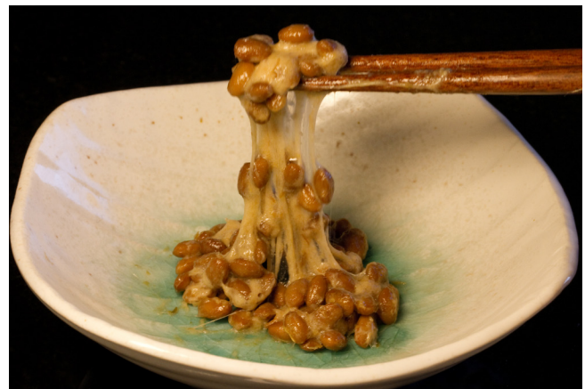
Fermentation transforms food through the action of yeasts and bacteria. Nattō (pictured) is a Japanese dish made from fermented soybeans.