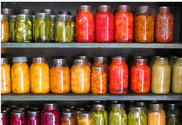
Canning is a preservation technique that can use glass jars (pictured) or metal cans.

Have each group read its section and discuss: What food processing methods are described? What does this tell us about why food is processed? Have each group choose a representative to present their responses to the class. Summarize presentations on the board and highlight food processing techniques, such as preservation (e.g., freezing, canning), pasteurization , enrichment , and fortification .