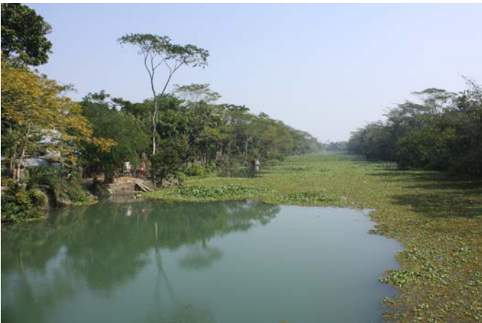
Canal in Galachipa

the ways climate change is already impacting potable water access was important to the creation of a document that I hope will contribute positively to future work the EIU undertakes in relation to climate change adaptation. In addition, living in Dhaka, Bangladesh's capital city, even for a few weeks, gave me a more nuanced understanding of the complexities the city, and the country, are facing than I could ever have gleaned from reading articles. It is evident that Bangladesh has made public health gains in recent decades, and that the economy is growing, but the gains seem tenuous in light of the intense pollution, growing population, ongoing poverty, various sources of water pollution, and potential for natural disasters the country also faces. Solving the coming public health challenges will require a multidimensional approach, and it was intriguing and enriching to spend my time at icddr, reflecting on what a small piece of this response might look like. The trip was a valuable, practical addition to my course work and I am very grateful to have the support to travel to Bangladesh for this learning experience.