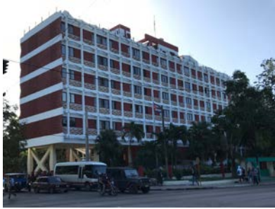
Cuban Institute of Ophthalmology