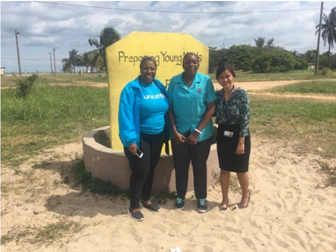
School visit in Stann Creek district, Belize