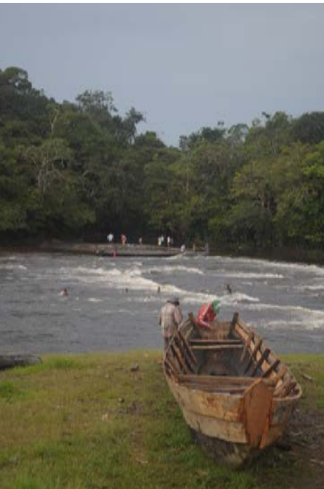
Figure 1: Multi-purpose use of the river by indigenous tribes. Front to back: boat-building; children playing in the rapids; people traversing the rapids by foot while their boat is lifted across the rapids.

Currently, twenty-seven thousand inhabitants call Vaupes home; 95% of them are indigenous. In this territory, there are three native reservations: Bacatí-Arara, Yaigojé-Río Apaporis and the east region of Vaupes. Indigenous people spread among 233 communities and occupy more than 90% of the territory.