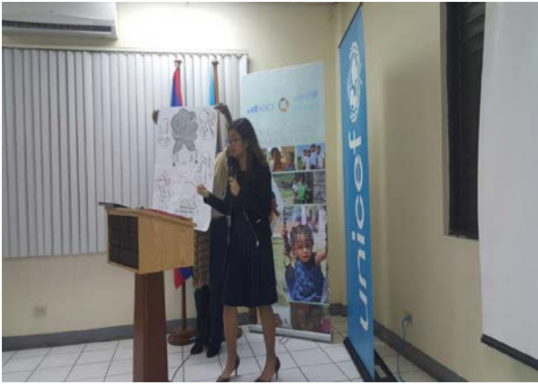
Open House and Validation Meeting