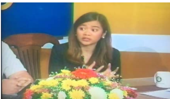
Interview in Love stations' morning show with representatives from UNICEF and Ministry of Health