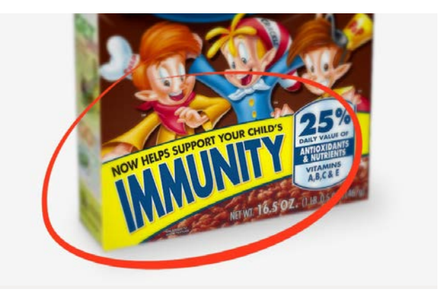
Kellogg's has been criticized for making controversial label claims about its products. In 2009, a claim about boosting immunity (pictured) was discontinued after public health advocates challenged its validity.

-Kelly Brownell, epidemiologist and obesity expert